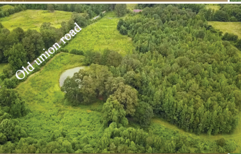
Paved Road Frontage

DISCLAIMER: Redmont Auction & Land Co. is a selling agent only. All property is sold AS-IS. Information provided is deemed to be reliable; however, Purchaser and/or Purchaser's Agent/Broker shall bear the responsibility to confirm all calculations and/or information prior to the Auction. Properties (chattel or real) may be added or withdrawn at the Seller's discretion. Seller, or the Selling Agents, may deny admittance to the auction any person if they disrupt or attempt to disrupt the sale. Announcements made prior to the auction supersede all printed material. No sale will be contingent on financing. 2021 AGENCY DISCLOSURE: REDMONT AUCTION & LAND CO., INC. REPRESENTS THE SELLER.